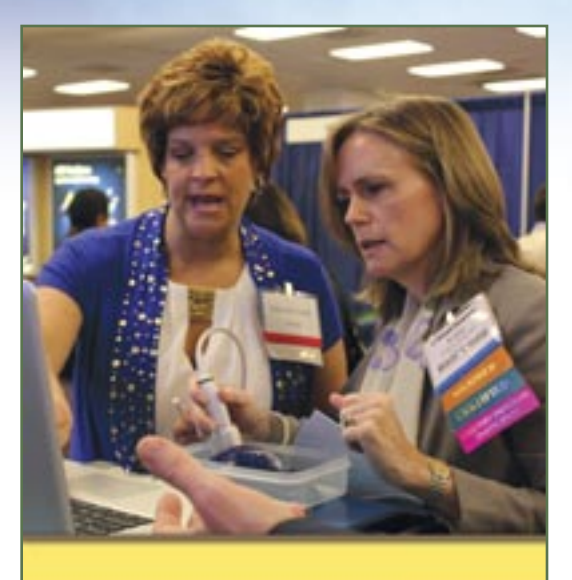
Exhibit Hall Hours

Genomic Health, Inc. Philips Healthcare GSSNA Hologic, Inc. Precision Therapeutics, Inc.